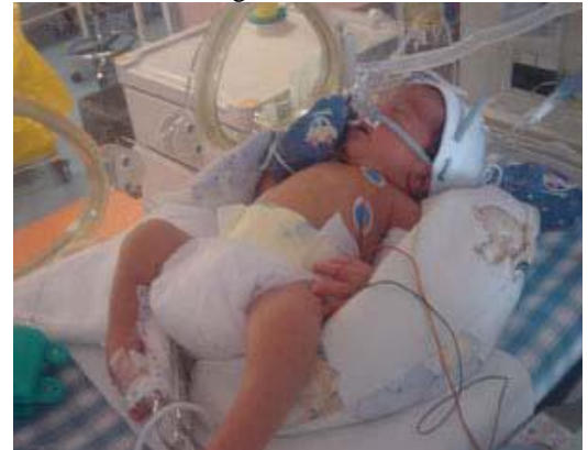
Figure 2: snapshot of a Neonatal Intensive Care Unit

In hospitals, babies in the NICU are monitored with the infrared monitor on the extremities for measuring oxygen saturation in the blood and heart rate, using ECG electrodes only in the most critical situations. The time for monitoring varies and depends on the patient's condition: some babies may be monitored for one day or two, some may require continuous monitoring for weeks or even months.